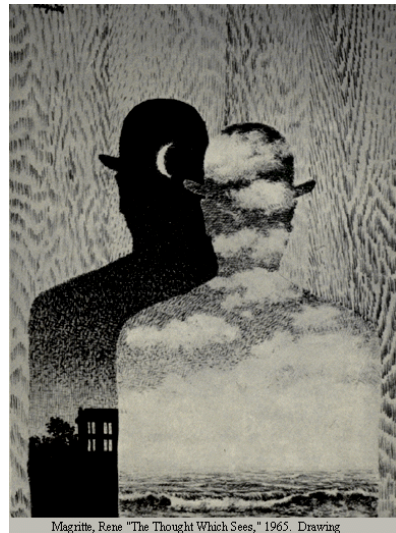
Magnitte, Rene "The Thought Which Sees," 1965. Drawing

Chiaroscuro, Tint, Shade, Tone, Hue, Scale, Depth, Three-Dimensional, Value, Gloom, Happiness, Warmth, Menace